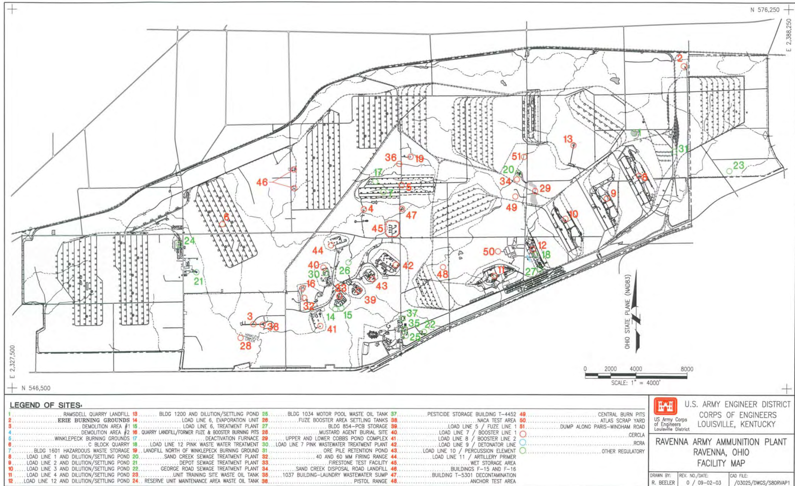
Fig 1-2 RVAAP Facility Map